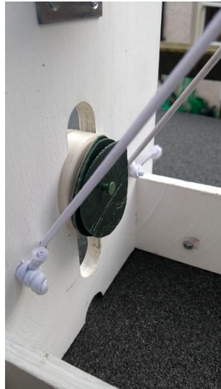
Cylinder holder and pin in place.