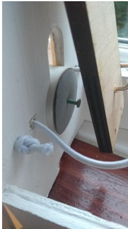
Pull pin holding arm and arm in striking position.